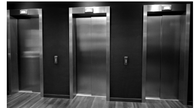
Building information systems