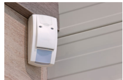
Burglar alarm system