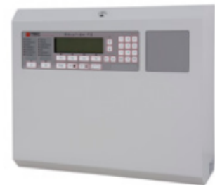
Fire Alarm System

If you have any further questions regarding the connection of technical systems, please contact us at any time at support@evalarm.de .