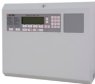
Fire Alarm System

For connecting alarm systems, EVALARM provides several possibilities. You can connect alarm systems via SMS, Email or other external systems like ESPA-interface or printer port.